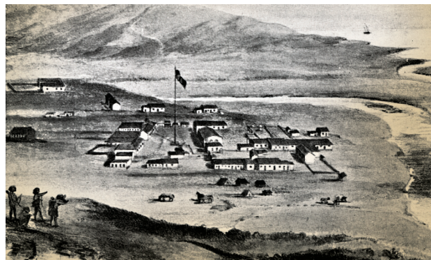
Old Town San Diego, 1846

In 1822 a Mexican military command arrived in San Diego. Mexico had gained its independence from Spain the previous year.