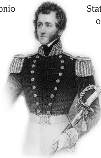
Commodore Robert F. Stockton

San Diego's Mexican era ended abruptly in 1846, when the United States declared war on Mexico. Initially the residents made little resistance to American occupation, but the situation eventually turned San Diego families against one another. Some remained loyal to Mexico, while others supported the United States. The town was occupied and won back several times—one major battle took place in nearby San Pasqual Valley. In 1846 U.S. Navy Commodore Robert F. Stockton captured San Diego. The war between Mexico and the United