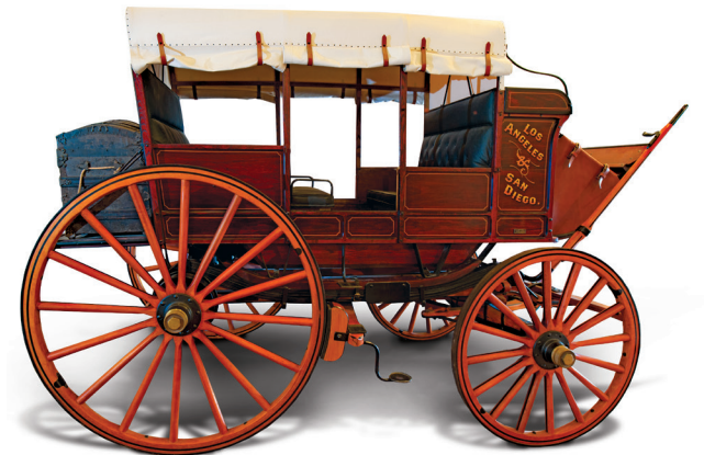
Reproduction of Seeley line mudwagon at the Seeley Stable Museum

In 1867 San Franciscan Alonzo Horton arrived in San Diego to begin building nearby New Town. Old Town enjoyed a slight resurgence