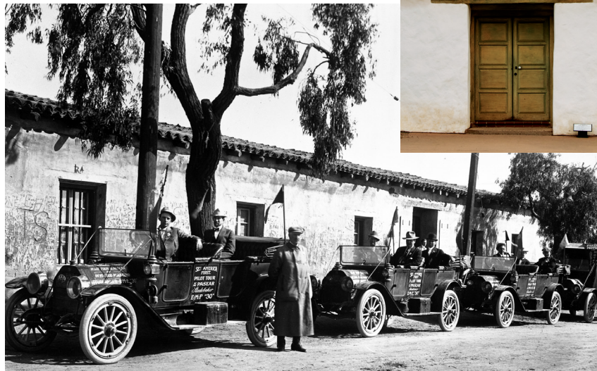
Top: La Casa de Estudillo Bottom: Auto touring, ca.1920s