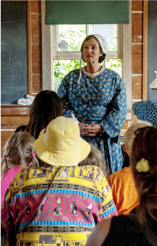
School group listens to Living History volunteer portraying an 1865 schoolteacher.

of those who came before them to better understand California's beginnings.