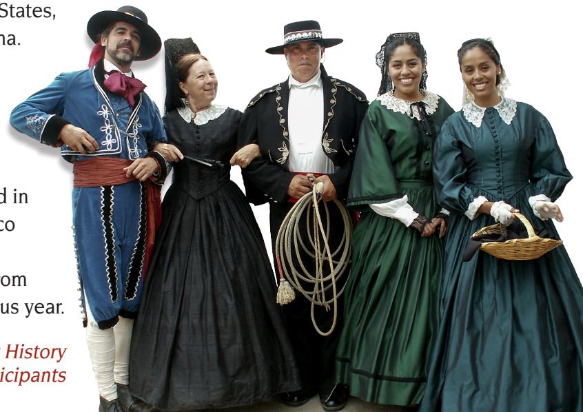
Living History participants