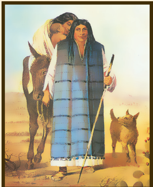
The Kumeyaay drawn by an artist with the 1849 U.S. Boundary Commission expedition

The Kumeyaay lived on the San Diego River at a village they called Kosa'aay . For thousands of years, the people migrated between ocean and mountains—gathering seafood, acorns, and the necessities of life. Today a native plants garden marks part of the territory of that early settlement before the arrival of the Spaniards. At first, the Spanish settlers were welcomed by the Kumeyaay, but devastating challenges to traditional ways increasingly affected their lives. Kumeyaay culture proved resilient, and today many Kumeyaay proudly continue their traditions with modern adaptations.