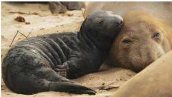
Young elephant seal napping

Don't miss the fascinating northern elephant seals. From December to March, they can easily be seen resting, having pups, battling, and mating on the beach up the road from San Simeon Bay at scenic vista points on the coast side of Highway 1.