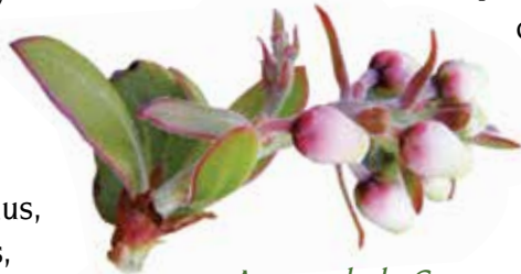
Arroyo de la Cruz manzanita

The park is home to rare and endangered plants, including maritime ceanothus, dwarf goldenstars,