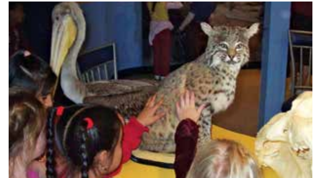
Coastal Discovery Center exhibit

Friends of Hearst Castle (FHC) is a nonprofit cooperating organization that supports preservation and interpretation of the park. Through membership and fundraising, FHC provides funding for educational and interpretive programs and artifact conservation programs. These programs provide visitor appreciation and enjoyment of this unique historical and cultural resource. For specific details, visit www.friendsofhearstcastle.org .